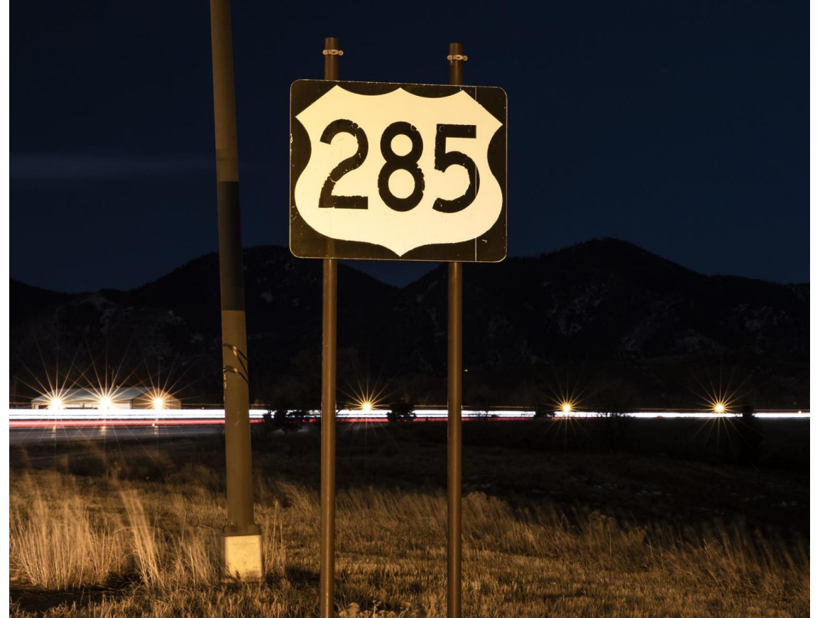
Highway US 285 traffic sign.