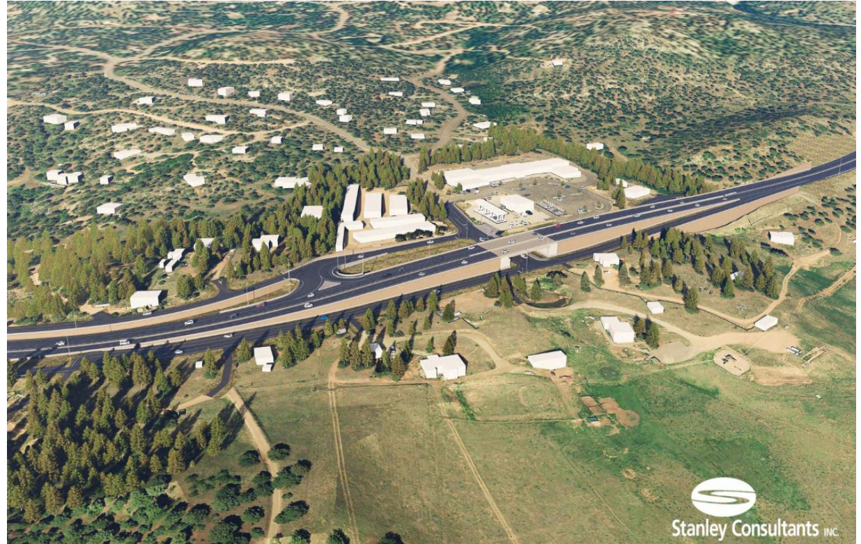
Aerial of Proposed US-285 and Kings Valley Alignment