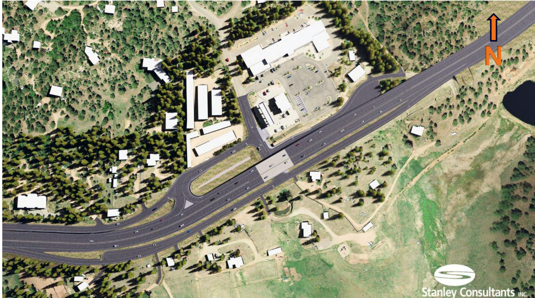
Aerial view of proposed interchange