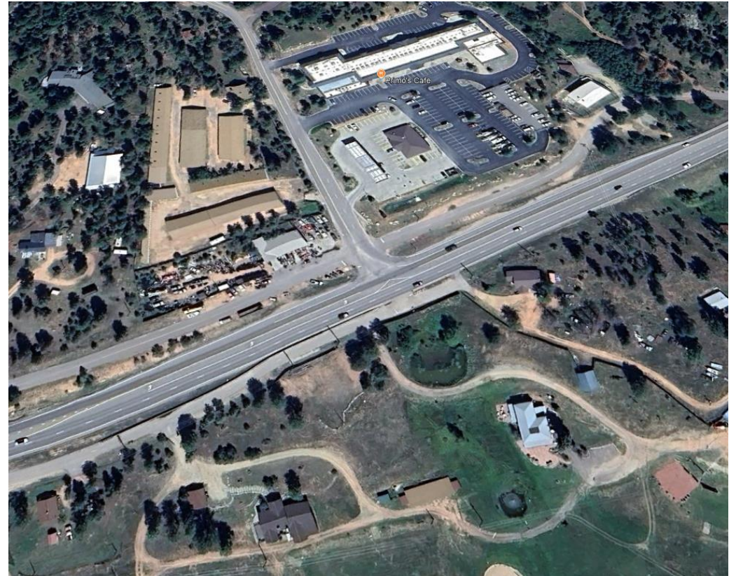
Aerial of Existing US-285 and Kings Valley Alignment